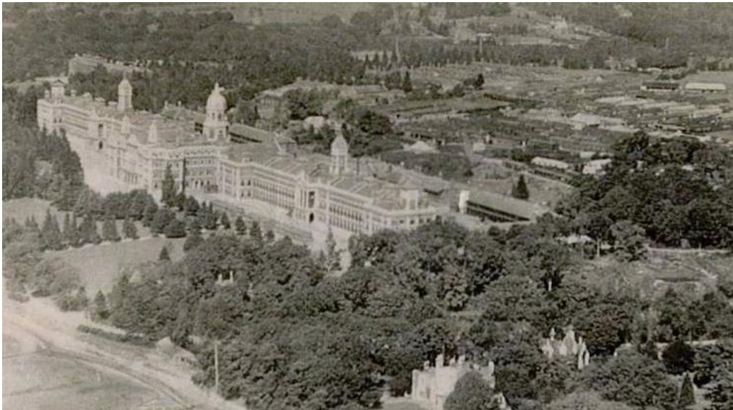
Royal Victoria Hospital, Netley