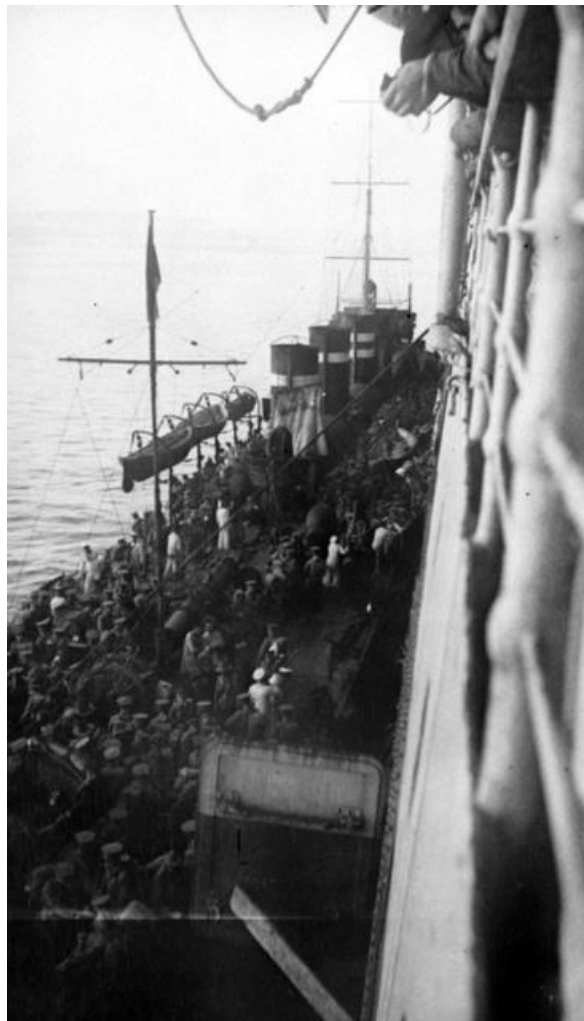
A scene on the deck of the troopship HMT Minnewaska whilst the Australians were waiting to disembark for the landing on Gallipoli Peninsula. 25 April, 1915